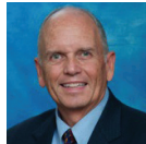
REAR ADMIRAL (RET.) GARRY J. BONELLI, USN CHAIRMAN, NAVY SEAL FOUNDATION

Resilient warriors and resilient warrior families are important parts of the future of Naval Special Warfare (NSW). The Navy SEAL Foundation stands shoulder-to-shoulder with our teammates to help ensure our community not only endures, but thrives following the heroic sacrifices of so many after nearly 13 years in the battlespace and on the homefront.